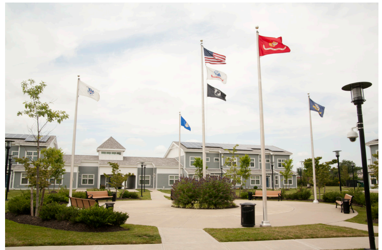
Developed by: Concern for Independent Living

SUPPORT HUD PROGRAMS, HOUSING CREDITS & BONDS!