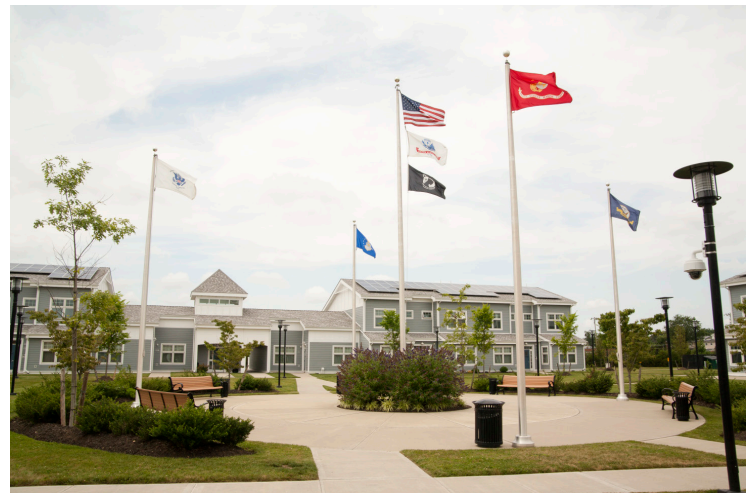
Developed by: Concern for Independent Living

SUPPORT HUD PROGRAMS, HOUSING CREDITS & BONDS!